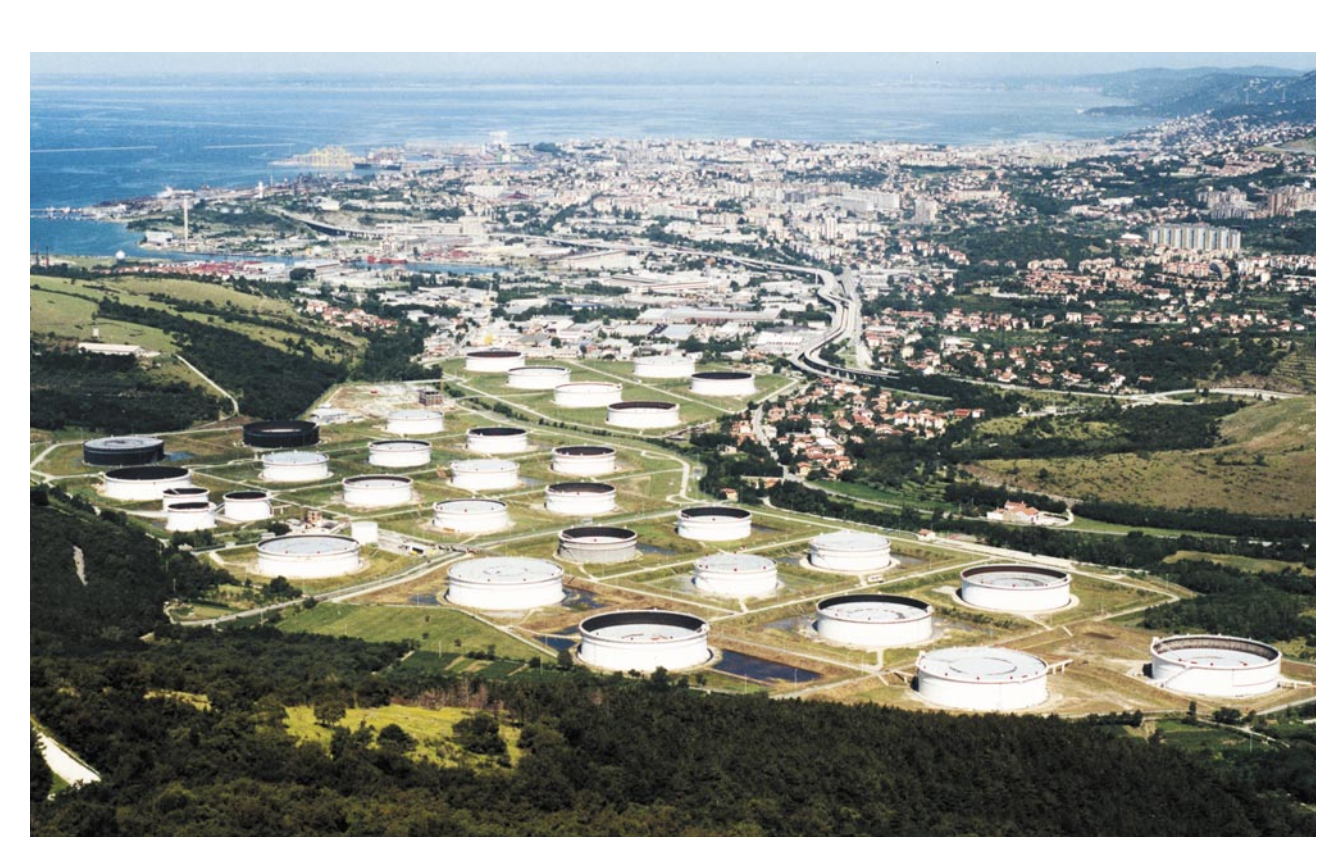
Tank farm, Trieste (Italy)