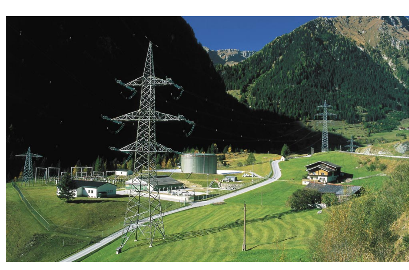
Pump station, Gruben (Austria)