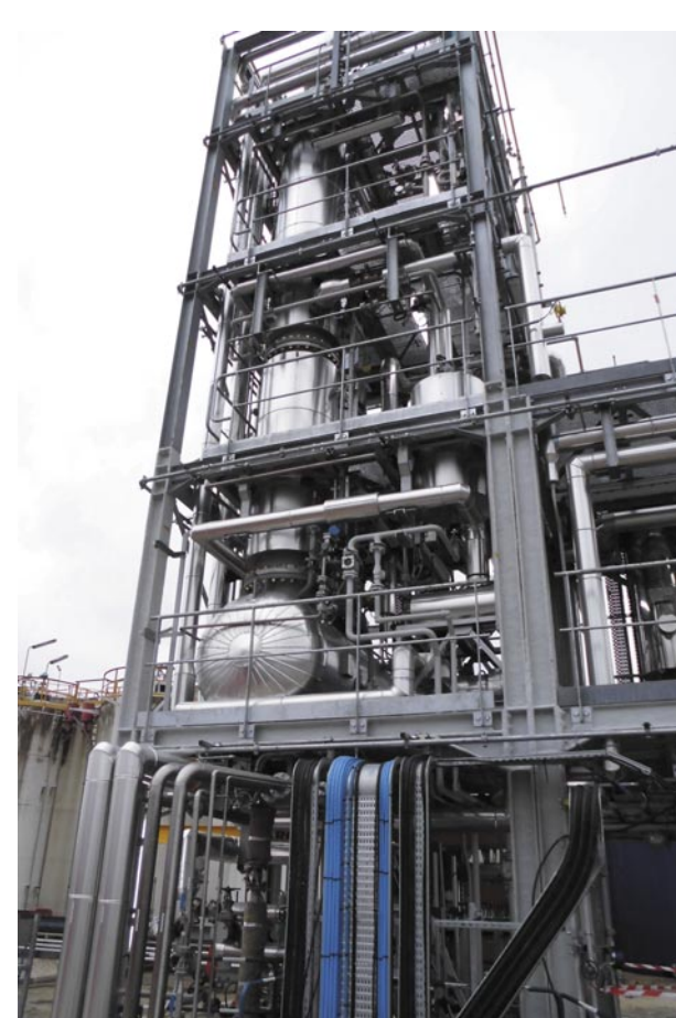
Transmix processing unit