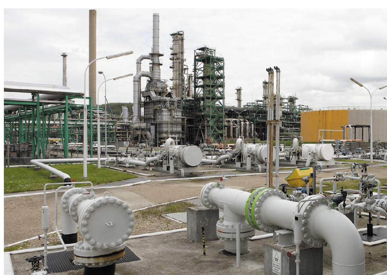
Gonfreville pumping station