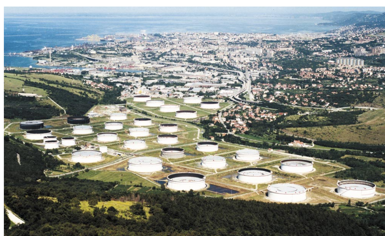
Tank farm, Trieste (Italy)