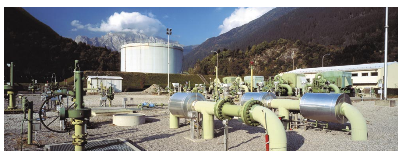
Pump station, Paluzza (Italy)