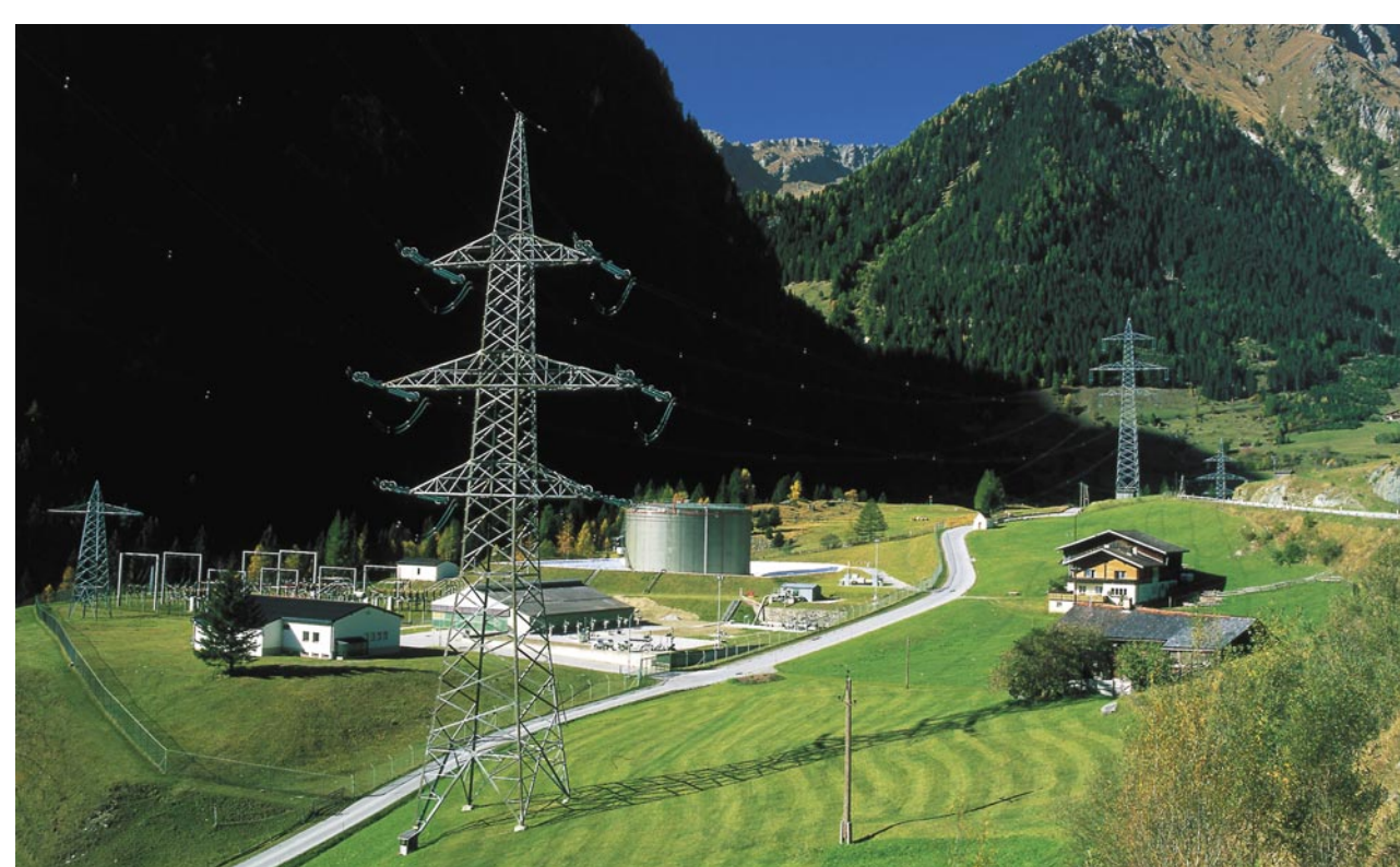
Pump station, Gruben (Austria)