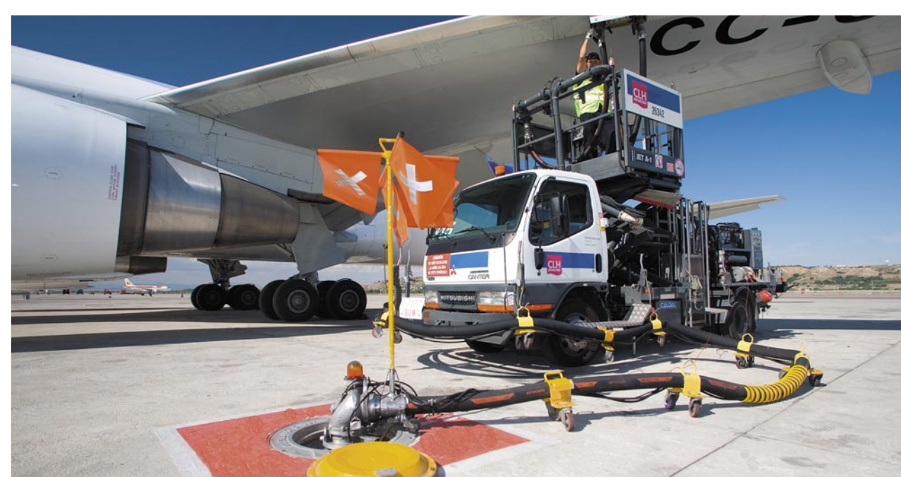
Service into plane