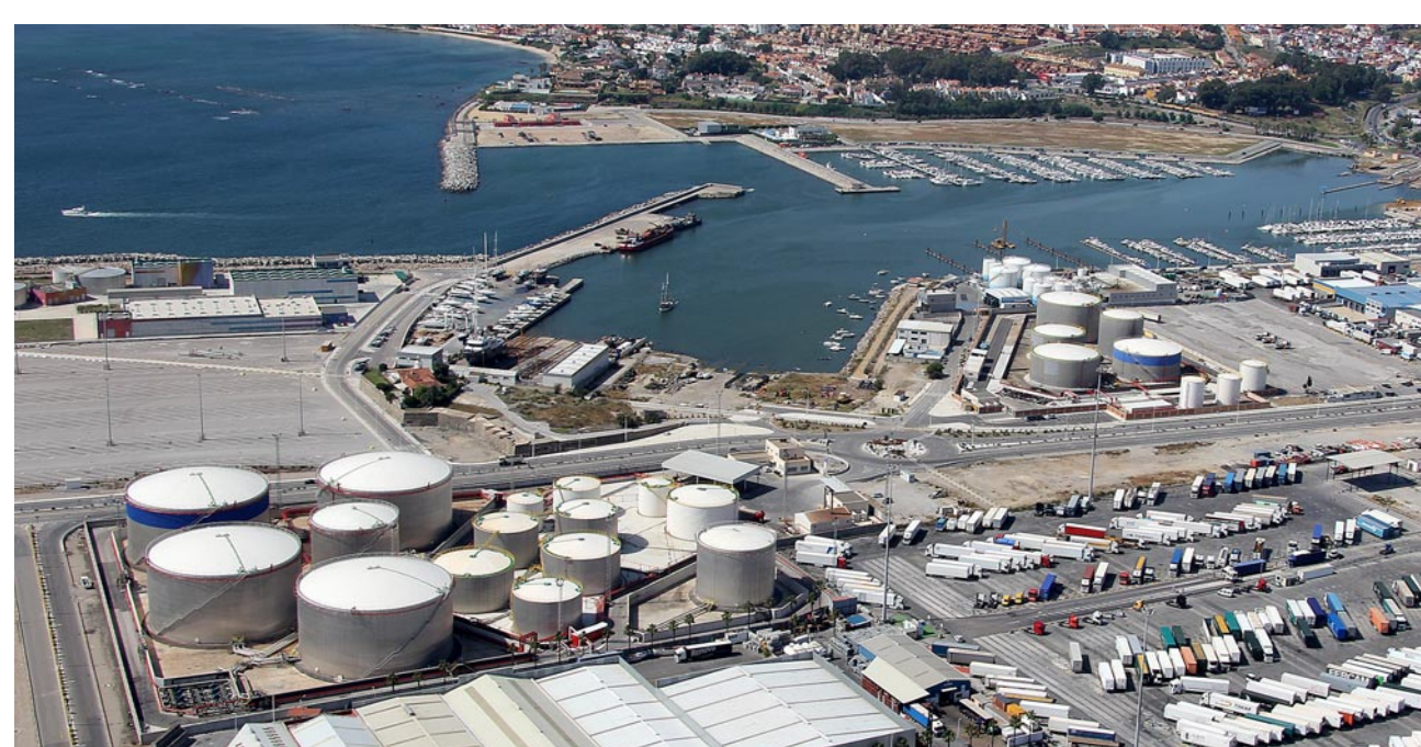
Algeciras bunkering service facility