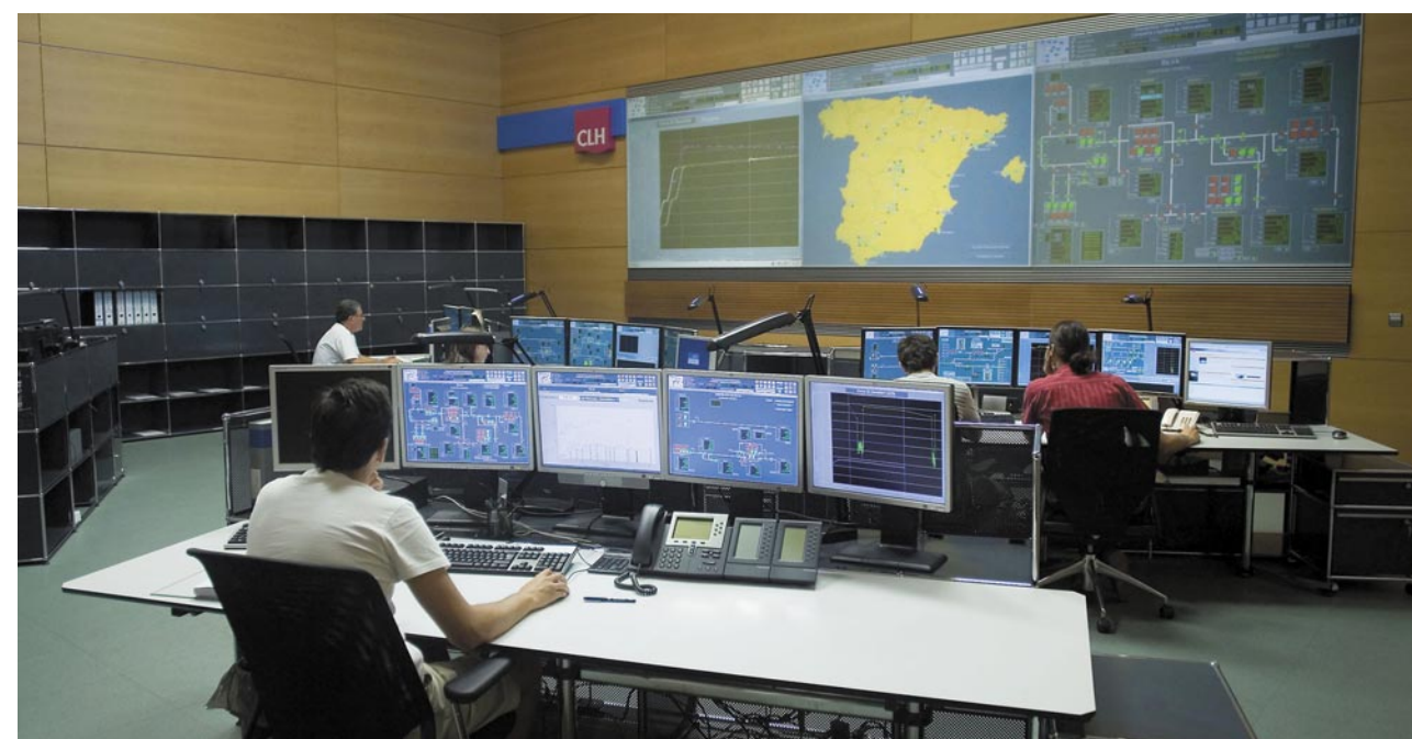
Pipeline control centre