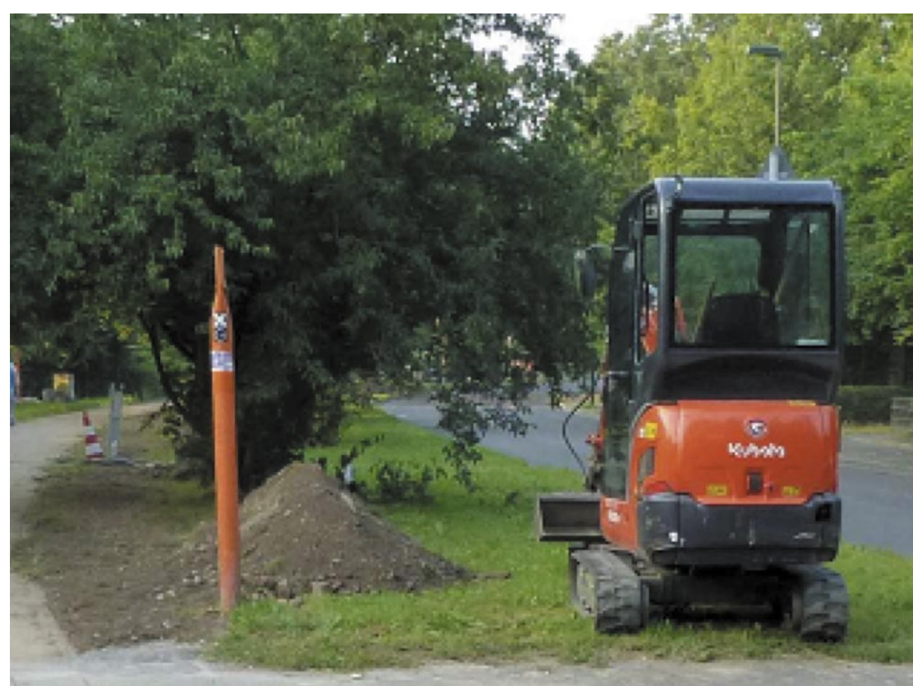
Digging without permission