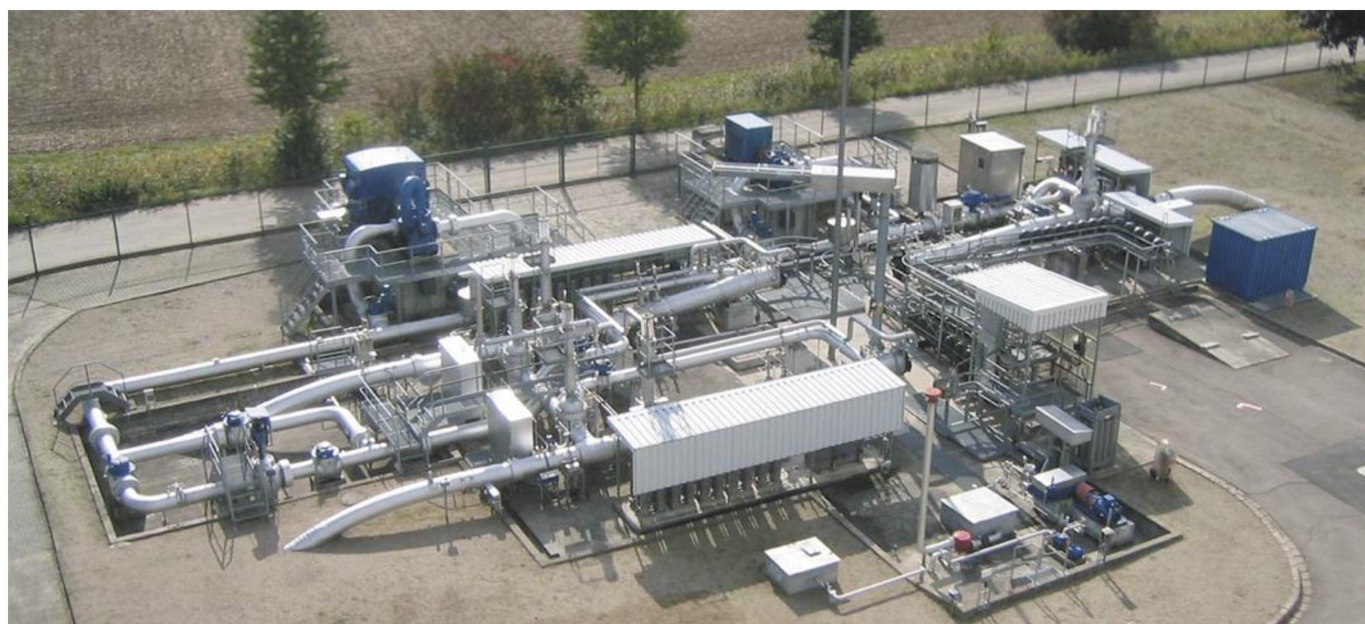
RMR pipeline station