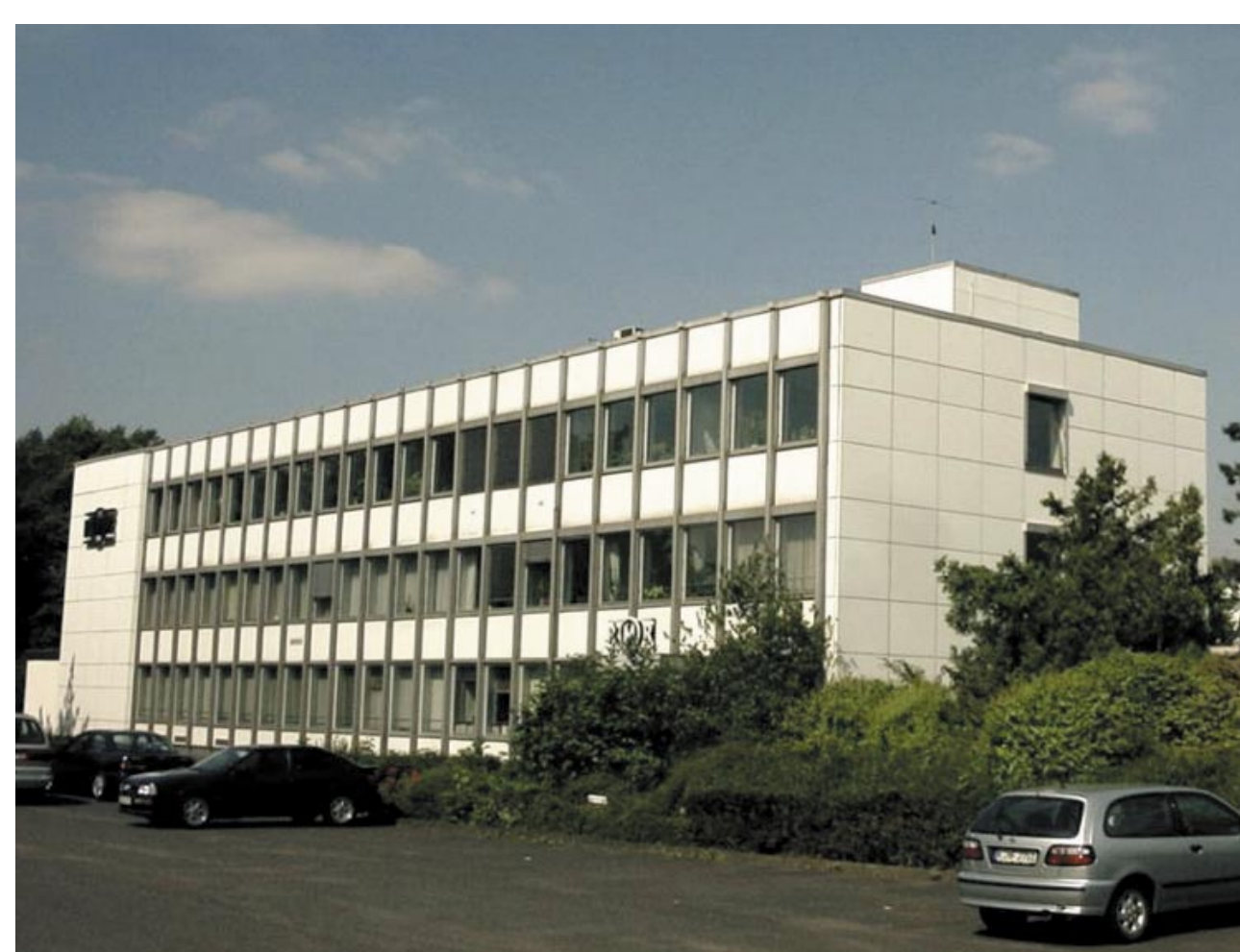
RMR Headquarters, Cologne